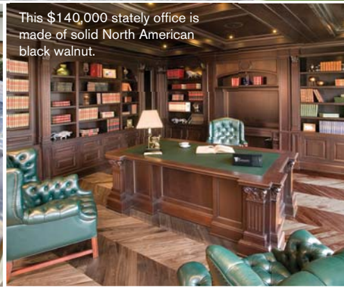
This $140,000 stately office is made of solid North American black walnut.