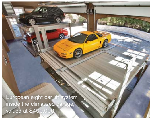
European eight-car lift system inside the climated garage, valued at $400,000.

Every spatial extent of Saxony Manor has been artistically and architecturally